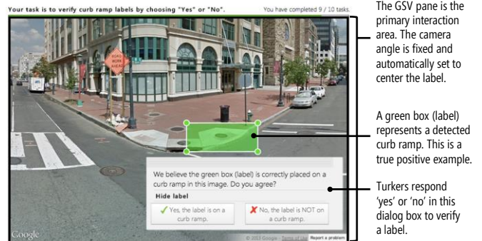
Figure 1: We explore initial approaches to scalably detect accessibility problems in GSV images by combining automated approaches with human computation . This figure shows our validation interface for crowd workers to verify automatically detected curb ramps.

We first created a test dataset defined by two geographic regions of interest in Washington DC: a 0.71 km 2 semi-